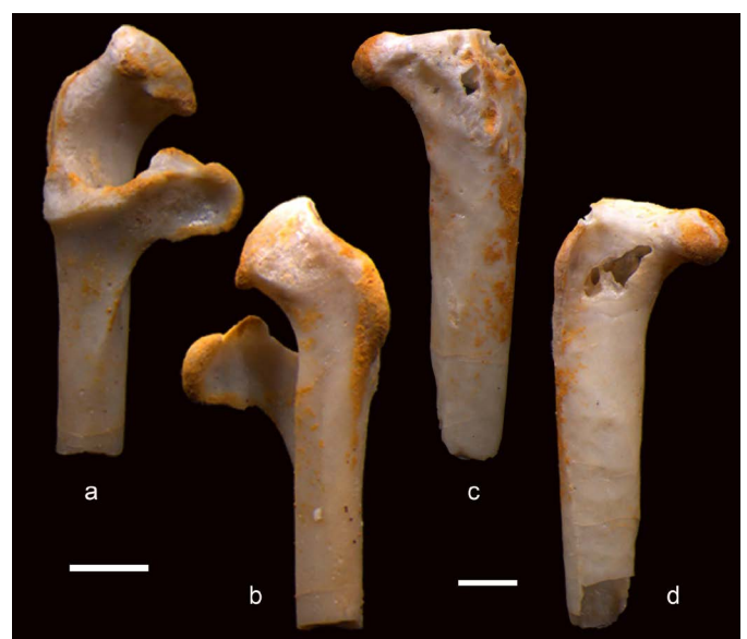
Figure 1. Chambicuculus pusillus , a-b: left coracoid, omal part, CBI-1-561, dorsal view (a) and ventral view (b); c-d: right femur, proximal part, CBI-1-562, dorsal view (c) and ventral view (d). Scale bars = 1 mm.

The very tiny bird, Pumiliornis tessellatus , from the Early Eocene (Lenz et al. , 2015) of Messel, Germany, was previously considered as related to the genus Eocuculus (Mayr, 2008; 2009;